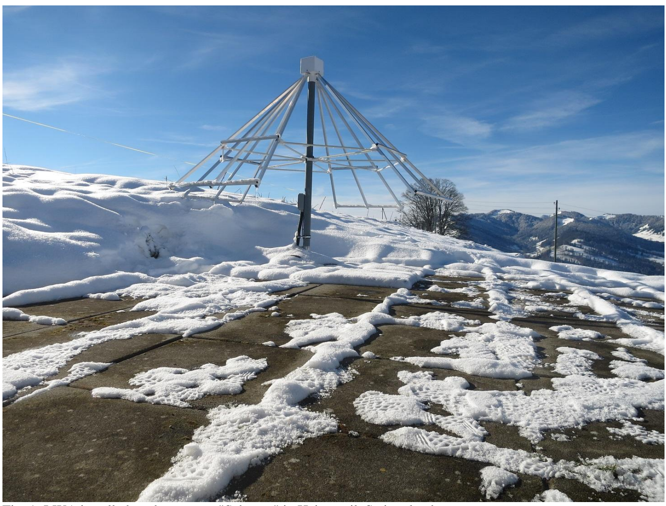
Fig. 1: LWA installed at observatory "Scherrer" in Heiterswil, Switzerland.