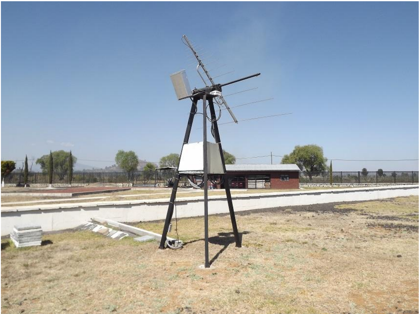
Fig. 2: Antenna with automatic positioning system at UNAM - Instituto de Geofísica unidad Michoacan Servicio de Clima Espacial – Mexico.