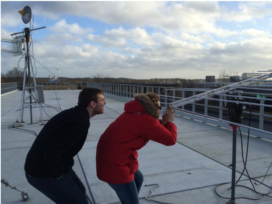
Fig. 1: Alignment of antenna positioning system to the sun.

Through three projects performed by students, Technical University of Denmark is now ready to join the e-Callisto network. The first project was to construct a log periodic dipole antenna (LPDA) and connect it to the Callisto receiver. Another project was to mount the antenna on motor in order to track the Sun automatically. For this an Arduino microprocessor system was used to control the motor. A third project was to stream data both to the e-Callisto server and to our internal use. It now seems that all parts are working and we can supply data from southern Scandinavia. The responsible contact person at Technical University of Denmark is Kristoffer Leer (mail: kloor (at) space.dtu.dk)