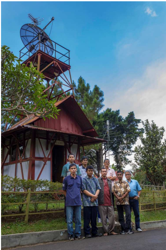
Fig. 1: Crews in front of control room.

Antenna: CLP 5130-1, Preamp: MiniCircuits ZX60-33LN (ETH), Filenames: BOSSCHA-ITB_*.fit