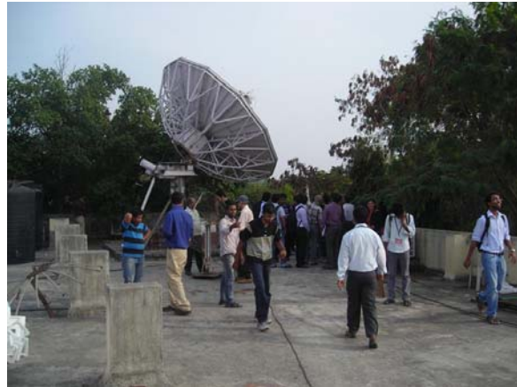
Fig. 4: more instructions close to the 4.5m dish