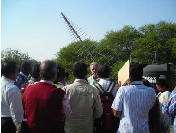
Fig. 3: Antenna instructions by the author