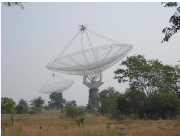
Fig. 5: Visit at GMRT (45 m dish < 1'500 MHz)