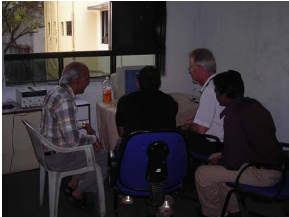
Fig. 6: Training related to Callisto software