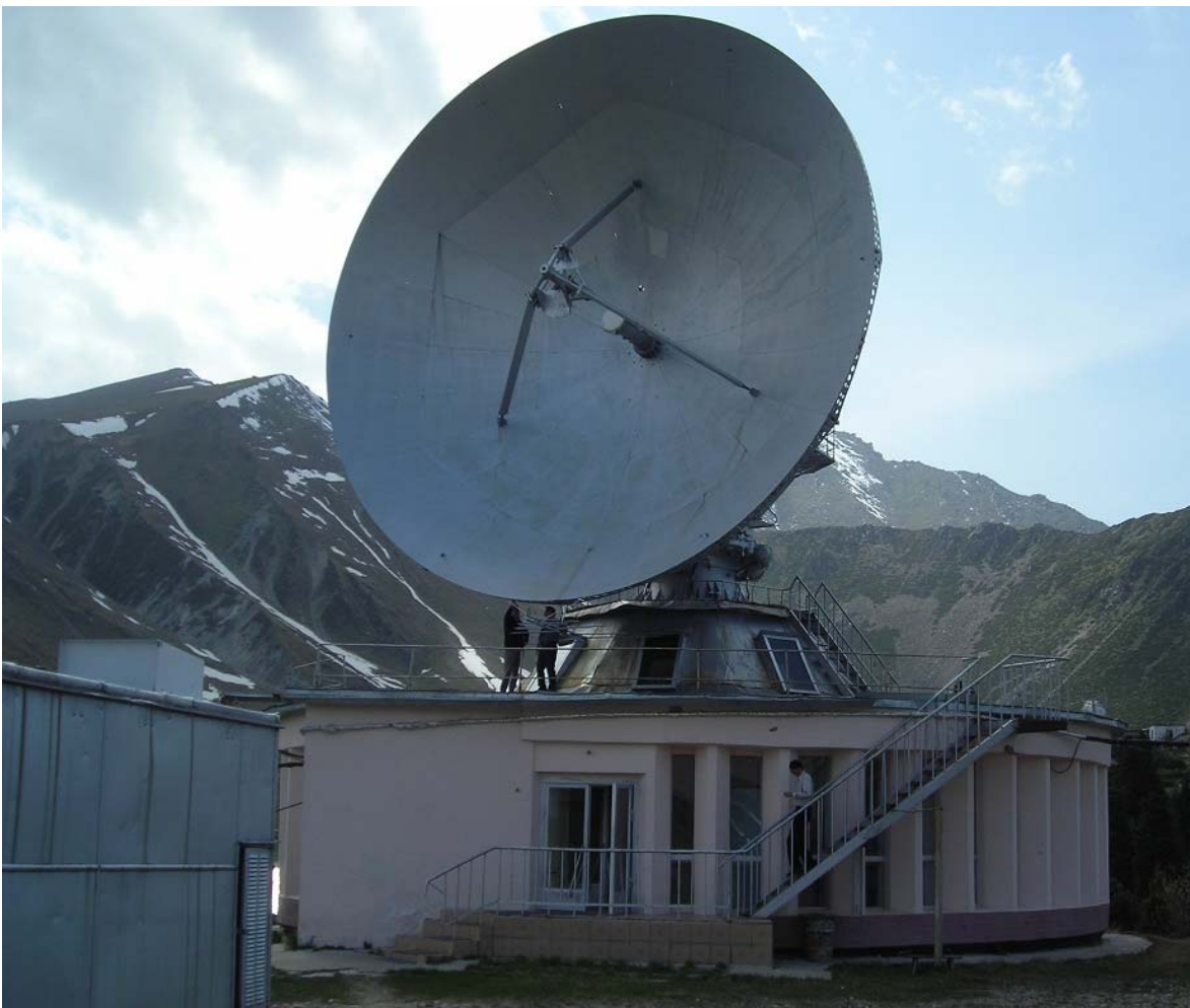
Fig. 1: Home made log-per attached to the lower rim of the 12m-dish. After the log-per antenna there is a low noise preamplifier KUHNE 0515B installed. Callisto, control – PC and power supplies are located in the observatory underneath the antenna.

The main Institute of Ionosphere is located on a natural hill above Almaty, while the Tian Shan observatory, see fig. 1 is in a very remote area in Tian Shan mountains about 30 km south of Almaty. Nowadays the measurements of the solar radio flux at frequencies of 1.078 GHz and 2.8 GHz (10.7 cm) are carried out on the regular basis. The observatory is equipped with optical telescopes and an optical interferometer SATI for recording the emission of night sky in the region of the mesopause. Coordinates of the observatory are 43° 03' North, 76° 58' East, Height is 2740 m above sea level; Local Time is GMT + 05h.